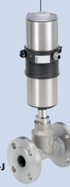
Valve system Continuous ELEMENT Type 8802-GD-L 2301 + 8694

If you click on any of the "More info" orange boxes below you will be taken to the product on our website where you can download the datasheet.