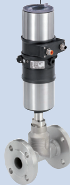
Valve system Continuous ELEMENT Type 8802-GD-I 2301 + 8692

Globe control valve with desired control unit